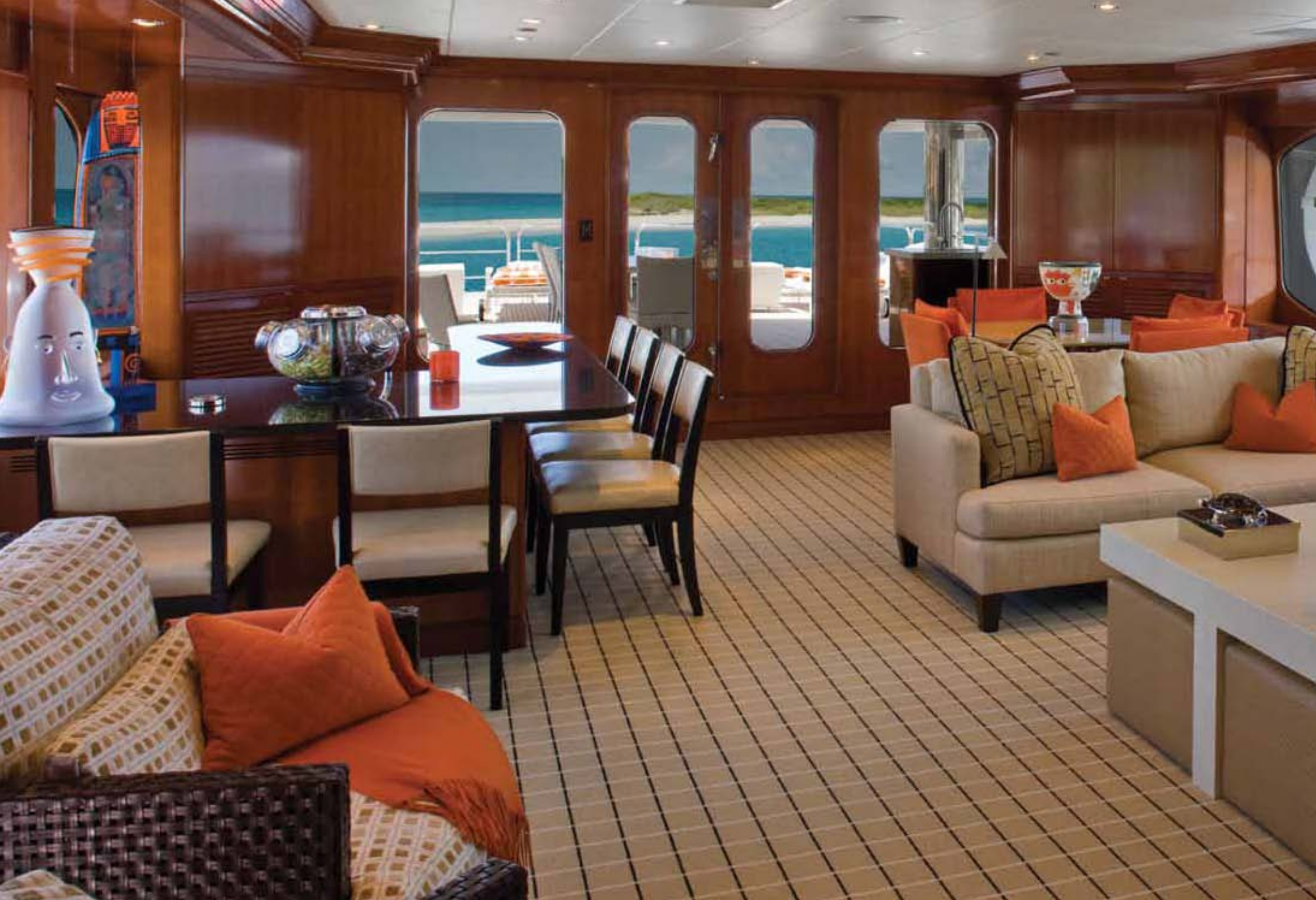
SKYLOUNGE & FOYER