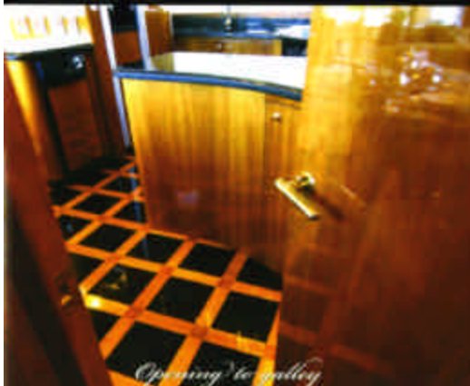
Opening to galley