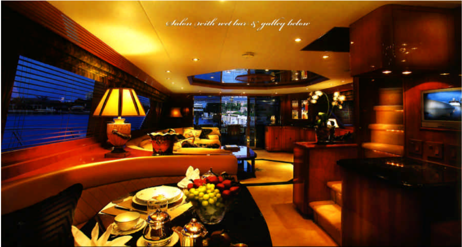
Salon with wet bar & galley below