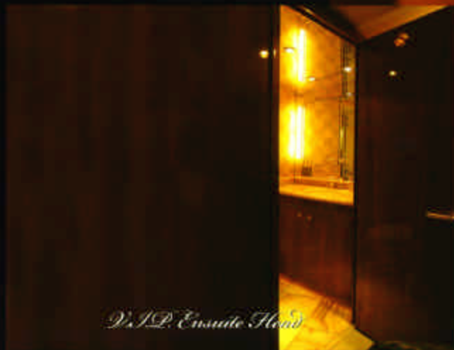
V.I.P. Ensuite Head

This high-gloss cherry wood paneled hallway leads to all staterooms.