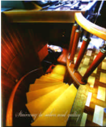
Heading to salon and galley

SPHEREFISHES's salon is a serene oasis providing intimate conversation areas with its sumptuous fore and aft seating. Fine art, rich textures and custom furnishings can be found throughout.