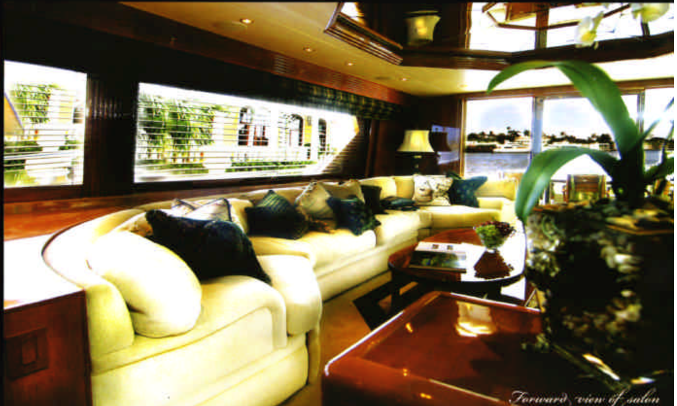
Forward view of salon