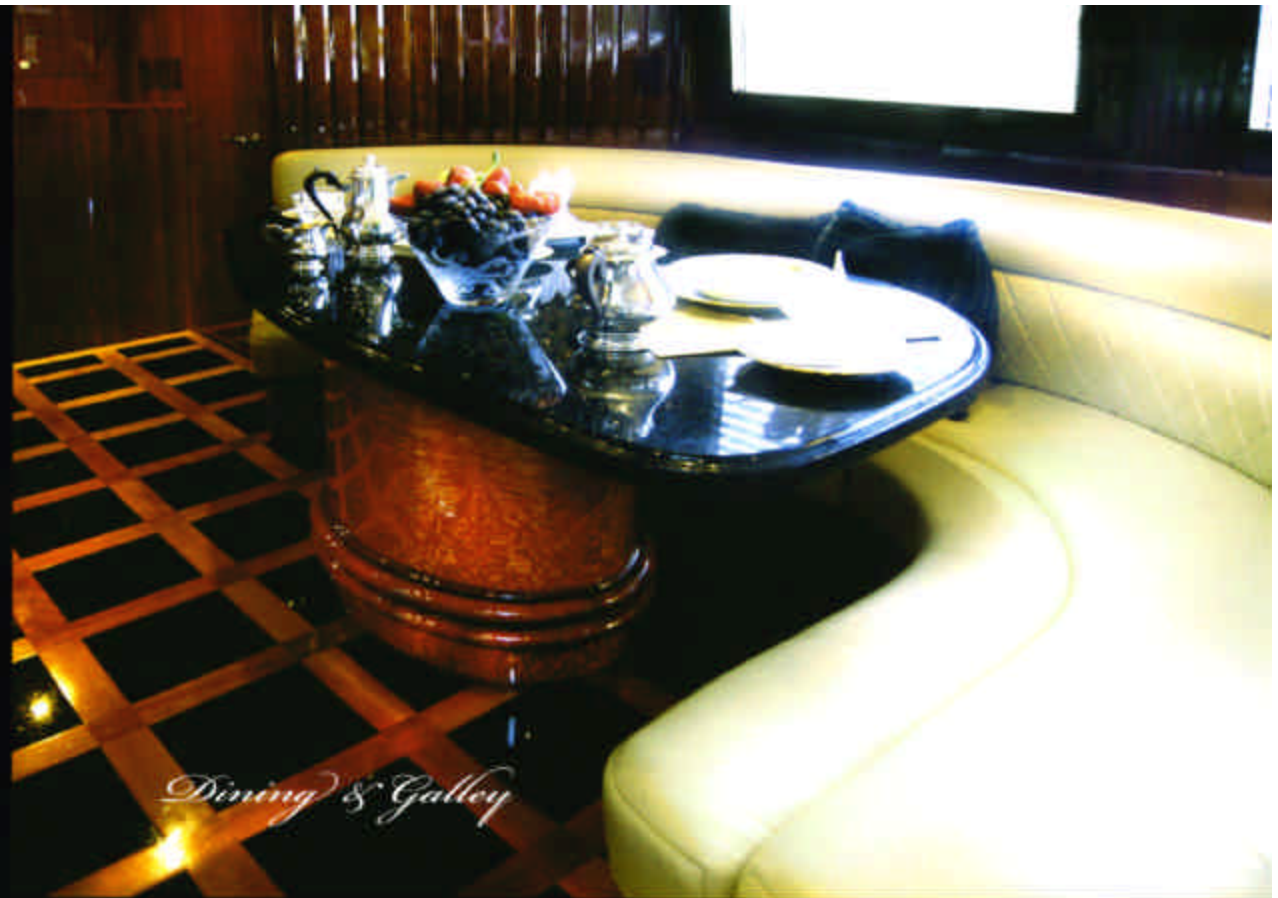
Dining & Galley

The galley features all major KitchenAid appliances, including compactor, refrigerator, dishwasher and four burner stove with oven, a Sharp microwave, double stainless sink, garbage disposal and numerous countertop appliances.