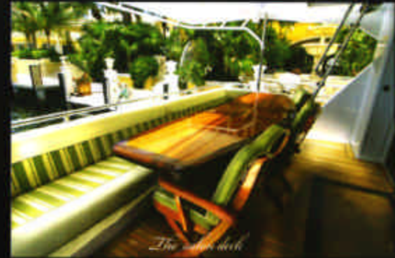
The salon deck

Aft on the salon deck is a large, pedestal mounted varnished teak table with teak folding chairs and large bench seat.