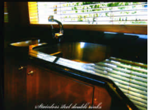
Stainless Steel double sink